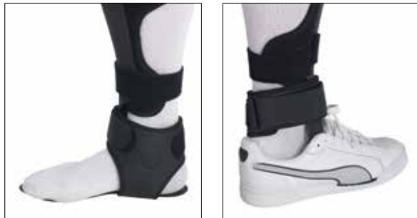
For Pes Valgus Control